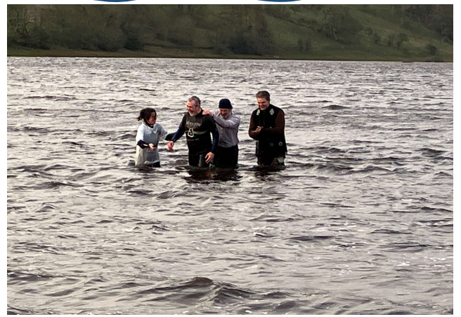
The Easter Daybreak Service at Semerwater went ahead, including a full immersion baptism. Fortunately 'Storm Dave' had moved away in time, allowing a beautiful sunrise and a rainbow!